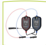
IP30 Insert phone