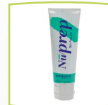
Nuprep® preparation gel