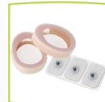
Electrodes and Infant EarCups™