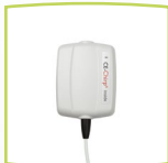
MB 11 Box